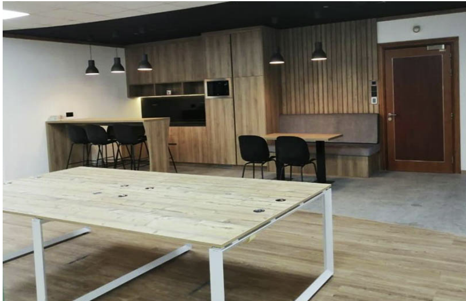
VIRGIN MOBILE HEADQUARTERS