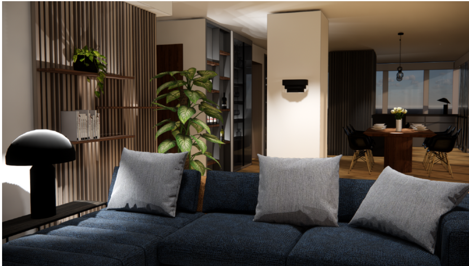
CONVERSION/ REMODELING OF APARTMENT IN AL BATEEN TOWER TO LUXURIOS APARTMENT