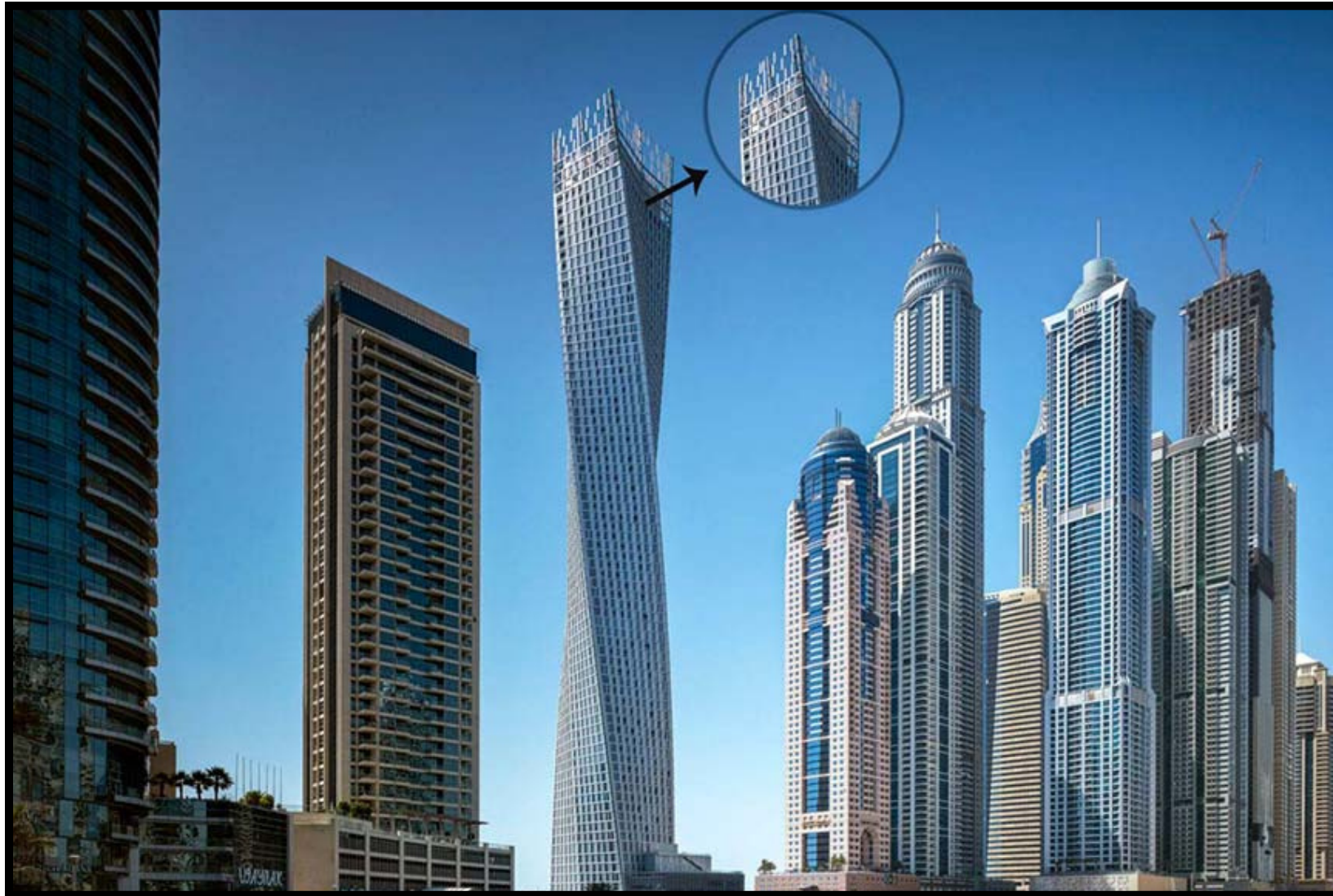
CONSTRUCTION OF A NEW DUPLEX AT CAYAN TOWER ON TOP OF THE PHS